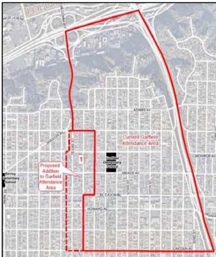
Reassigned to Garfield (Area 1 on maps)

Where? See maps and list of addresses below.