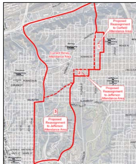
Reassigned to Jefferson (Areas 2 and 3 on maps)

4000-4598; 4301-4599 Arizona St 2320-2598; 2321-2499 El Cajon Blvd 4300-4598 Hamilton St 2400-2498; 2323-2499 Howard Ave 2320-2498 Lincoln Ave 2401-2599 Madison Ave 2400-2598; 2321-2599 Meade Ave 2400-2598; 2321-2599 Monroe Ave 2400-2498; 2401-2499 Polk Ave 4000-4598; 4001-4599 Texas St